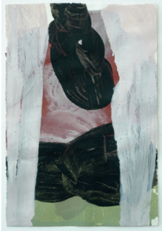
Untitled #5 The Encounter 2012 oil and acrylic on paper 11 1/8 x 7 5/8 in. / 28.5 x 19 cm

The initial form, the one first laid down on linen or on paper, in a painting by Van Cauwenbergh is often, by the painting's conclusion, nearly obscured, tenderly buried beneath washes of subsequent colors and forms. Unfolding, retreating, hide and seeking — they are disappearing evocations of the very human and complicated experience of living in the City of New York: being one among millions of intimate strangers.