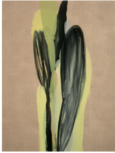
Decline 2012 oil on linen 60x45 in. / 152.5x114.5 cm

In Decline , a blossoming form is placed front and center; a series of green and black loosely and energetically applied strokes suggest fronds waiting to seize the light through a forest floor. Each of several vertical gestures is bound one to the other: they sway and stagger, not quite in unison, yet neither able to separate one from the other. Here, again, is the urban experience of intimate strangers: figures moving past and sometimes bumping into one another, the blur of their activity, walking along city sidewalks, making one difficult to distinguish from the other. In the past few years, the cityscape surrounding Van Cauwenbergh's studio was in constant flux; one building just across the street was being demolished while others were being built, creating slim and changing channels of light.