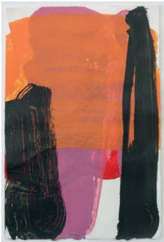
Untitled #4 2012 oil and acrylic on paper 11 1/8 x 7 5/8 in. / 28.5 x 19 cm

The paintings often suggest a figure, gaze slightly averted, but having a sense of weight that suggests sculptural form in conversation with painted image. The figurative allusions have a demure quality, emphasized by the sense of turning away that is implied by the broad brushstrokes atop the more solidly painted forms hidden beneath. A palette of bright colors, into which grey tones are worked, aids the often-melancholy mood of a Van Cauwenbergh painting. In Untitled #5 (The Encounter) (2012; oil and acrylic on paper), the theatrical nature of many of his compositions is revealed. A black, weighted form takes half-hidden center stage — an odalisque revealed through parted translucent curtains of dusky pink. A second coiled black form — sculptural and seemingly suspended from the top edge of the painting — seems captured in motion, stilled in the arc of a pendulum's swing, and is thrown into relief against a rising hillside whose terrain is pink powder against hard-bitten ruby lips. The space that is created, like in many of Van Cauwenbergh's paintings, is the space of the stage, a theatrical arena. Our gaze moves toward what we expect to be deep space, three-point perspective, but is consistently thwarted by the proscenium-inflected space. The implication of drama unfolding or stilled is potent.