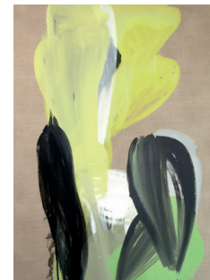
Seated Headless 2012 oil on linen 60 x 45 in. / 152.5 x 114.5 cm

Van Cauwenbergh's interest in the Symbolist painters of the early twentieth century includes fellow Belgian Gustave van de Woestyne (1881–1947), whose painting The Artist's Wife (1910) creates a barely-there distinction between figure and ground. While the slim woman's features are finely rendered, her gaze is nearly averted. She seems to look toward us because she must — perhaps as instructed by the painter himself. There is little distinction between the apricot-mauve color of her sheer dress and the skin that we know rests just beneath. Like Van de Woestyne, Van Cauwenbergh also creates transitions between the shifting light, between palette and form that seem to evolve in real time as we stand viewing a painting like Seated Headless (2012), implying, certainly, a classical torso with whom history has had its way. Seated Headless is a companion painting to Decline (2011; both oil on linen and 60 by 45 inches).